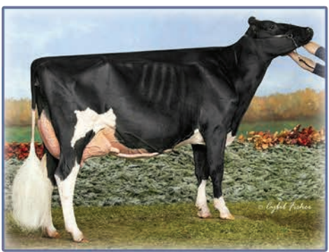
3RD DAM:BUDJON-JK DAMION EKLIPSE-ET EX-94 2E 2X JUNIOR ALL-AMERICAN NOMINEE IN MILKING FORM

2ND DAM: FLOYDHOLM MC EMOJI-ET EX-95 GMD ALL-AMERICAN JR. 3-YEAR-OLD COW-2019 1st JR. 3-YEAR-OLD COW & INT. CHAMPION INTERNATIONAL HOLSTEIN SHOW-2019